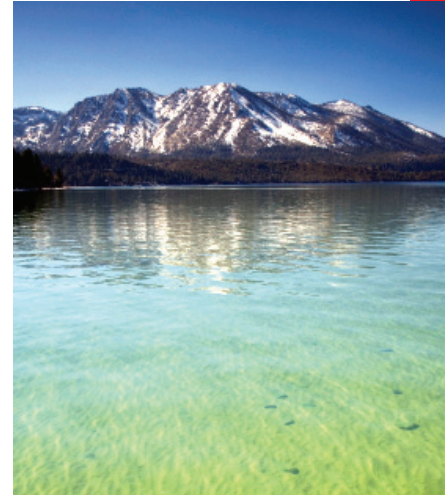
Lake Tahoe is using Elvis to bring tourists back to enjoy its scenic splendor.

Enroll in the CTIS Program and register for the Business Grammar and Writing course. Learn practical tips and techniques for successful business writing. This course provides basic understanding of grammatical relationships rather than mere memorization of rules. Acquire skills to better target your audience and establish positive communications with your clients. Enhance your writing skills through exercises and letters that are persuasive, controversial or just routine correspondence styles. Upon completion, you will have a portfolio of assignments for reference to gain greater confidence and proficiency in both your business and personal correspondence. The Business Grammar and Writing course begins September 1 and ends October 30, 2007. For CTIS Program information: http://www.buses.org/meetings_events_and_education/Education/Certified_Travel_Industry_Specialist/