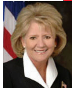
Transportation Secretary Mary E. Peters

Virginia Beach has plenty to offer Marketplace attendees.