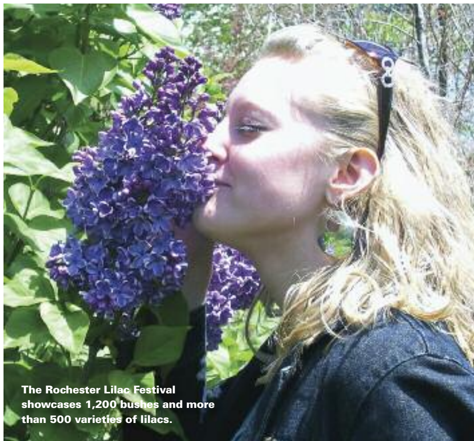
The Rochester Lilac Festival showcases 1,200 bushes and more than 500 varieties of lilacs.

OTHER ATTRACTIONS: William J. Clinton Presidential Center and Park; Central High School National