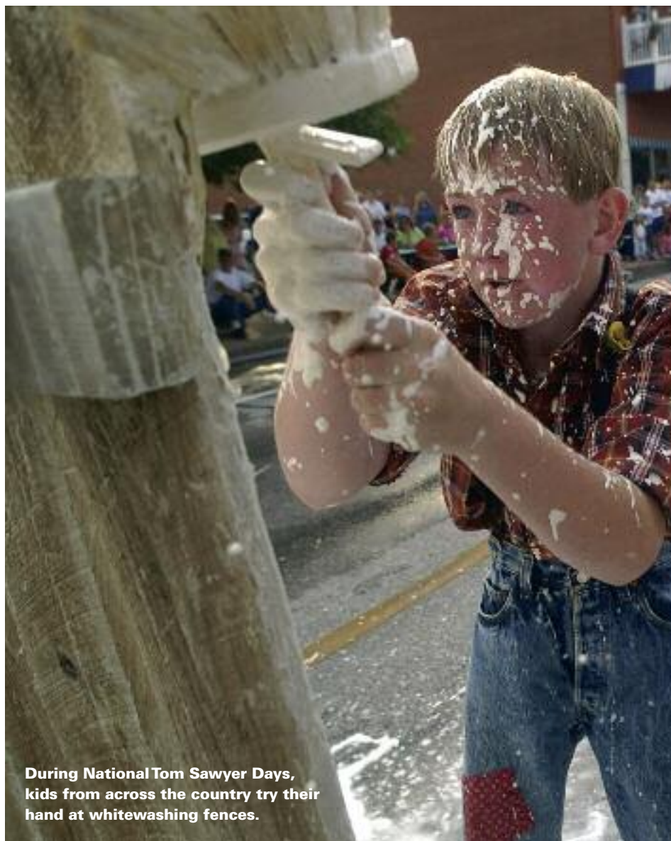
During National Tom Sawyer Days, kids from across the country try their hand at whitewashing fences.