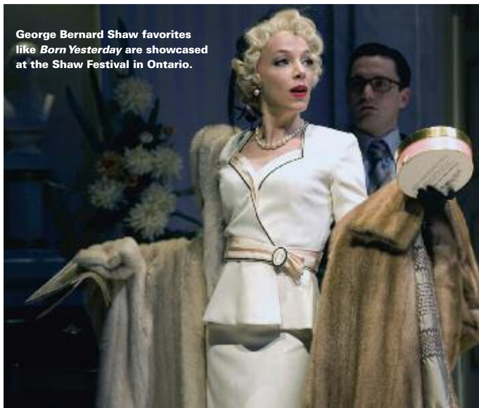
George Bernard Shaw favorites like Born Yesterday are showcased at the Shaw Festival in Ontario.

Celebrate the unique cultures of Denmark, Finland, Iceland, Norway, Sweden, and Saami Land (indigenous peoples of Northern Scandinavia) at the Scandinavian Hjemkomst Festival held annually in Moorhead, Minn. and Fargo, N.D. Take part in a feast of Nordic foods and sing or dance with some of the most talented musicians in the world. Explore Nordic traditions, and discover modern Scandinavian cultures. Shop for unique Scandinavian arts and treasures in the Nordic Marketplace. Exhibits about the replica Viking ship Hjemkomst and Hopperstad Stave Church