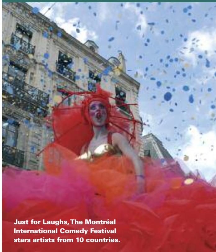
Just for Laughs, The Montréal International Comedy Festival stars artists from 10 countries.