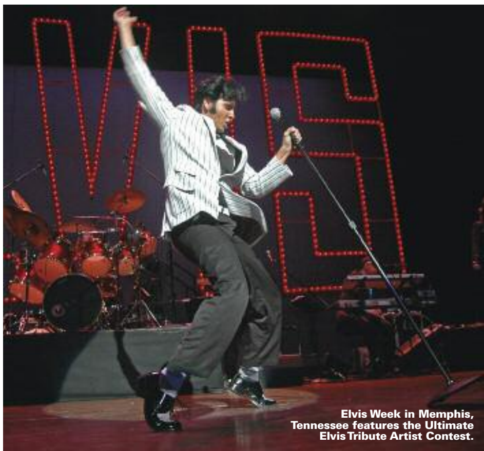
Elvis Week in Memphis, Tennessee features the Ultimate Elvis Tribute Artist Contest.